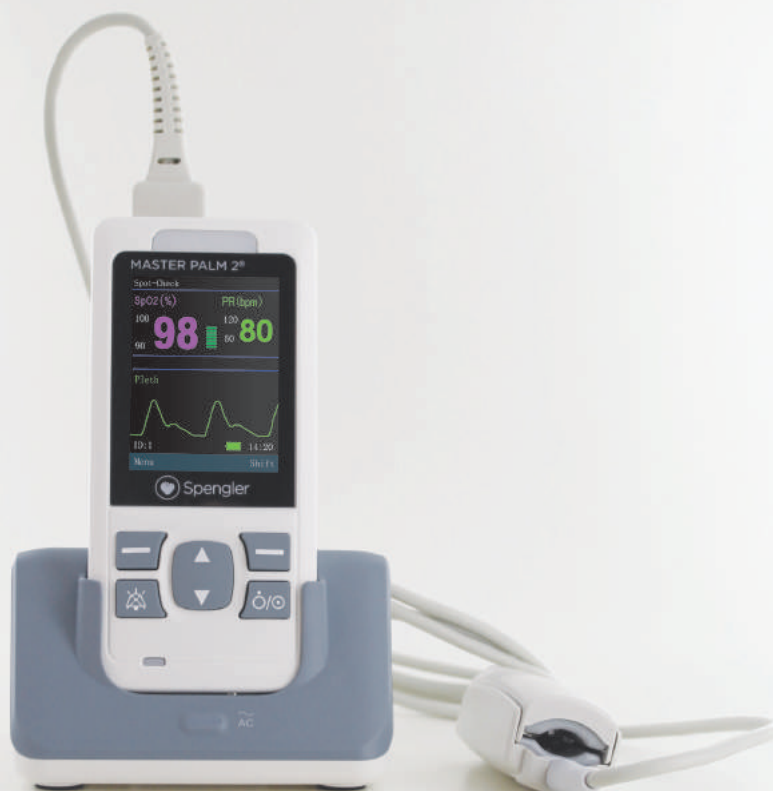
(optional charger socket)